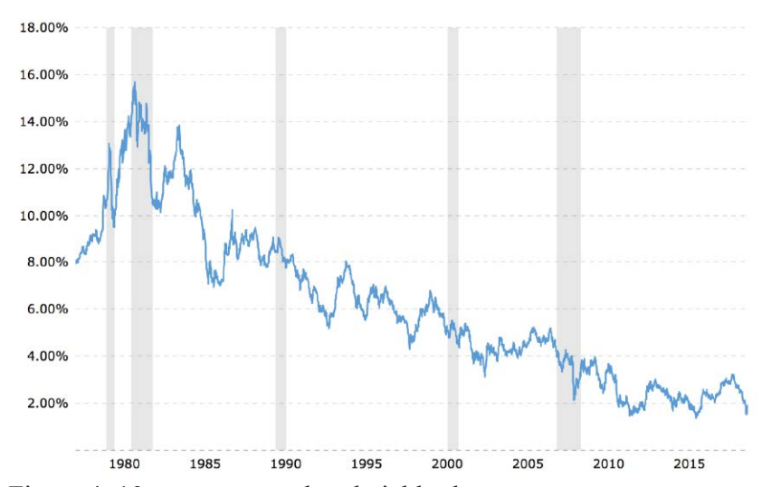
Figure 4: 10-year treasury bond yields chart

At the time, this made financial sense. In 1990, the yield on a 10-year treasury bond (the world's most widely traded bond) was 8%; now it hovers around 2% (fig. 2). The change in ROI is a result of the simplest economic rule – supply and demand. Once purchase was compulsory, the incentive to offer strong returns on behalf of bond issuers disappeared.