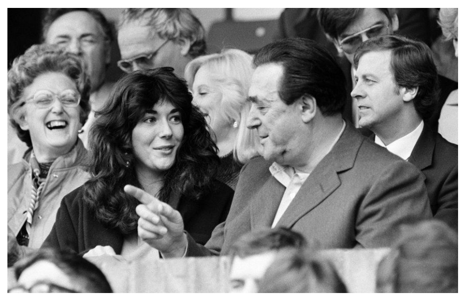
Figure 5: Robert and Ghislaine Maxwell at an Oxford United match, 1984

The press clamoured to ask how she had got away with it for so long. The question implied an accusation. Who knew? And why didn't they speak out?