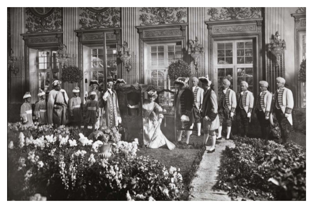
Figure 1: Madam Réjane seated with others in the "Garden of Versailles" at the James Hazen Hyde Ball.

No expense had been spared in creating the event. The two floors of ballrooms had been decorated in the style of the gardens of Versailles. Lemon and orange trees lined the corridors, while grass covered the floor.<sup>2</sup> Madam Réjane, a French actress of considerable fame, had been brought to New York to perform in a play written specifically for the party.<sup>3</sup> She is depicted at the ball in figure 1. Her fee, apparently, was a gift of a diamond tiara.<sup>4</sup> Dancers from the Metropolitan Opera House performed as well and, over supper, two orchestras sat at either end of the room and played alternately so the music never paused.<sup>5</sup> In total, the ball cost its host, James Hazen Hyde, an estimated $50,000, the equivalent of well over a million dollars now.<sup>6</sup>